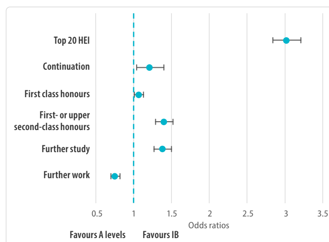
Figure 3. Odds ratio results by outcome type.

A study in the United Kingdom (UK) compared the higher education outcomes of students who enrolled in UK universities with either an IB diploma or an A level qualification . In line with previous research (HESA 2016; HESA 2011), the study found that IB diploma students were three times more likely to enroll at a top 20 higher education institution (HEI), 40% more likely to achieve at least an upper second-class honours degree, and 7% more likely to earn a first-class honours degree compared to matched A level students. Additionally, post-university, IB diploma holders were 38% more likely than their A level peers to be engaged in further study (figure 3: Odds ratios greater than one indicate that IB students were more likely to achieve the outcome) (Duxbury et al 2021).